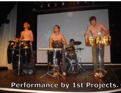
Performance by 1st Projects.