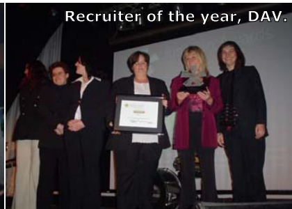
Recruiter of the year, DAV.