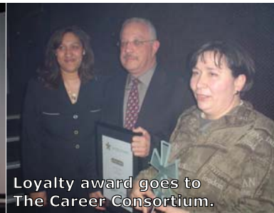
Loyalty award goes to The Career Consortium.

CareerJunction announced the winners of the first ever Career Seekers Choice Recruiter of the Year Award at a cocktail function in Johannesburg on 18 August 2004.