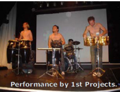
Performance by 1st Projects.