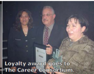
Loyalty award goes to The Career Consortium.

CareerJunction announced the winners of the first ever Career Seekers Choice Recruiter of the Year Award at a cocktail function in Johannesburg on 18 August 2004.