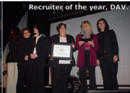
Recruiter of the year, DAV.